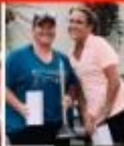
Tuesday Night Ladies