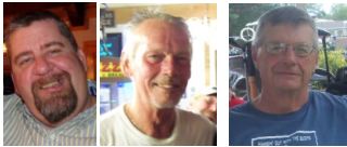
“Not” Bear Camp Open